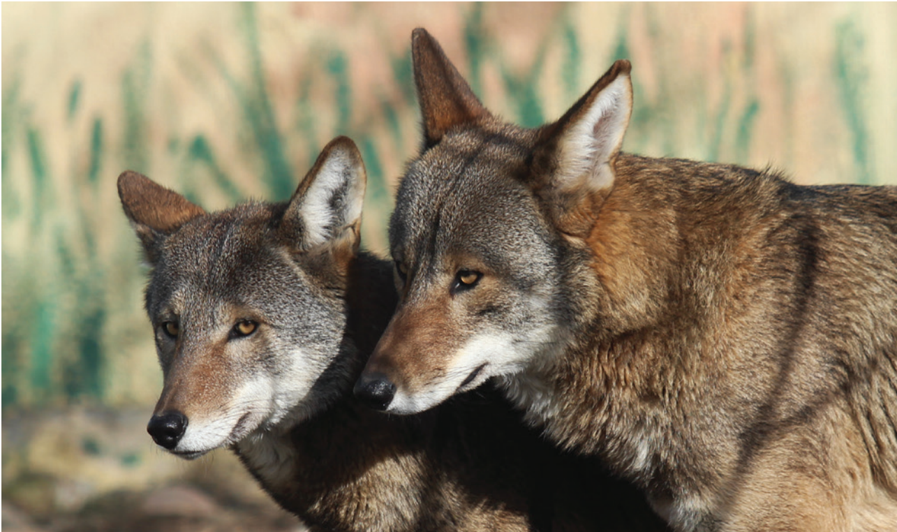
CHEYENNE AND WAYA , RED WOLVES